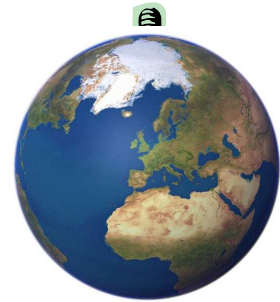
This is our world, a thing of beauty and wonderment. A legacy for our children and future generations to enjoy.

This publication will help in answering some of